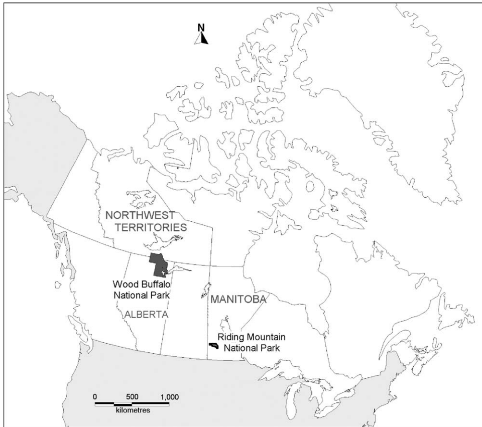
Fig. 1. Locations of Wood Buffalo and Riding Mountain National Parks in Canada.

The problem of bovine tuberculosis in wildlife is not unique to Canada. The complexity and controversy in addressing the management of bovine tuberculosis in wildlife and the interface of this disease with livestock and humans is global in scope, and occurs in many other parts of the world (Tweddle and Livingstone, 1994; de Lisle et al., 2001, 2002; Michel, 2002; Delahay et al., 2002; O'Brien et al., 2002; Schmitt et al., 2002; Caron et al., 2003; Phillips et al., 2003; Aranaz et al., 2004). The issue of bovine tuberculosis in wildlife cuts across a variety of stakeholder interests, and arises from a mix of ecological, socio-economic, and political issues and associated values. Within an atmosphere of conflict and uncertainty, wildlife disease reservoirs for bovine tuberculosis often pose a “wicked problem” (sensu Rittel and Weber, 1973; and see Gates, 1993; Ludwig, 2001) that is tricky, complex, and thorny (Rauscher, 1999).